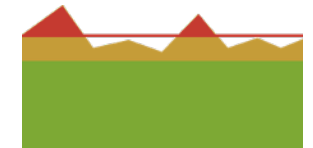
MAX DEMAND ALARMS